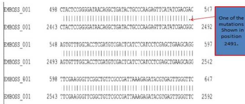
Fig. 2. A schematic representation of a mutation in 23S rRNA genes in online clustalW2 software. One of the mutations is shown at position 2491.

(Fig. 2). Also, the measurement of MIC in all M. pneumoniae -positive samples using the broth micro-dilution method, indicated that all specimens were sensitive to Clarithromycin, and no ML resistance was reported (Table 2).